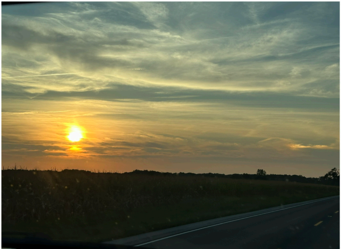
Spring Sunset