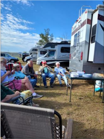
FOW Members waiting for breakfast at Terry Bison ranch