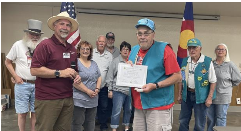
Fun on Wheels celebrating 30 years with Colorado Family Campers and RVers