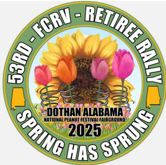
53rd FCRV International Retiree Rally 2025

Campvention Dates July 20 - July 26, 2025