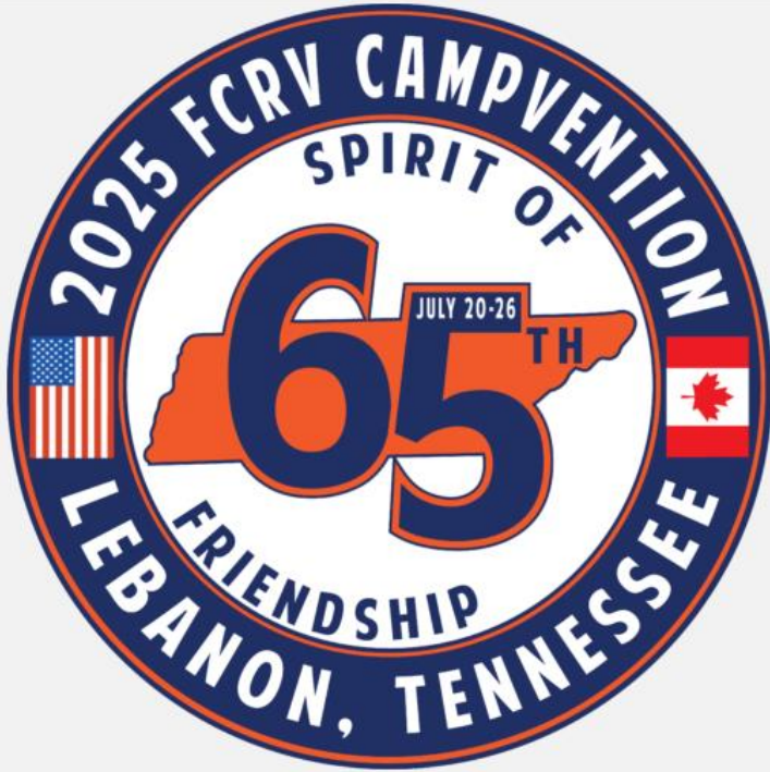
65th Annual Campvention 2025