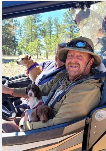
"The Woodland Wookies enjoyed 11 mile area dry camping!"