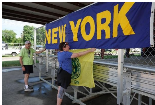
Getting the grounds ready for company