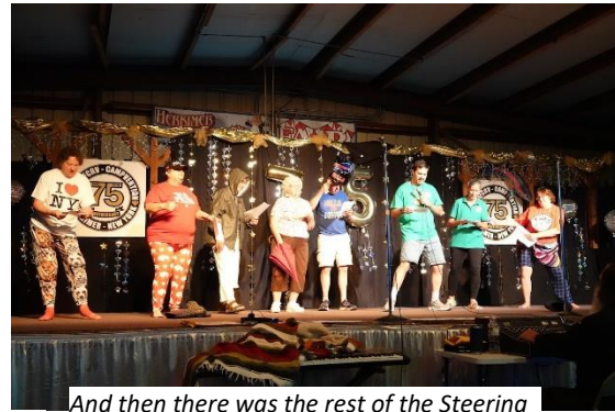
And then there was the rest of the Steering Committee.....