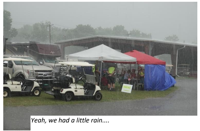
Yeah, we had a little rain....