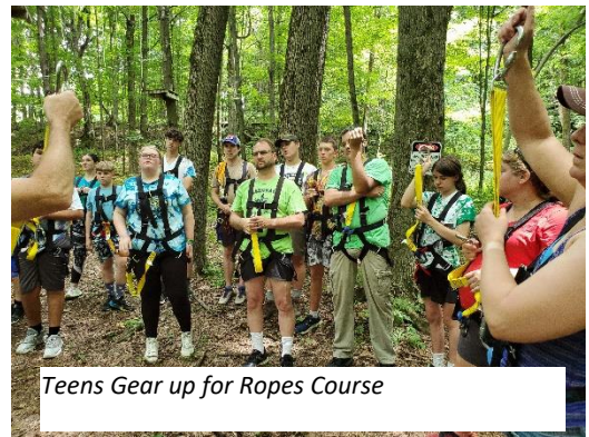
Teens Gear up for Ropes Course