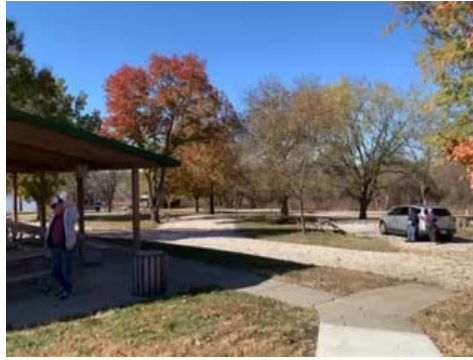
Picture taken at the Wolf Creek Group Site Oct. 25, 2022