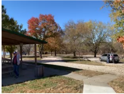
Picture taken at the Wolf Creek Group Site Oct. 25, 2022