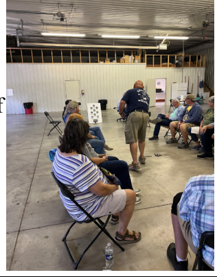
weather to bike ride everyday. Some toured all the small colonies which make up the Amanas. Lots of shopping was accomplished. We gathered one evening to eat a delicious German dinner at one of the local restaurants. Some competitive games of

We then traveled to Amana Iowa to camp for 5 days. Several members took advantage of the wonderful