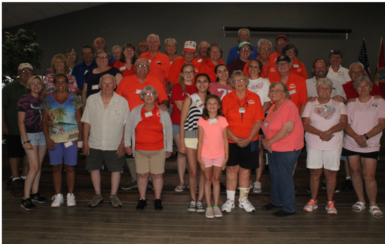
Southeast Regional Rally, June 3-5th, 2022 at Thousand Trails Orlando RV Resort