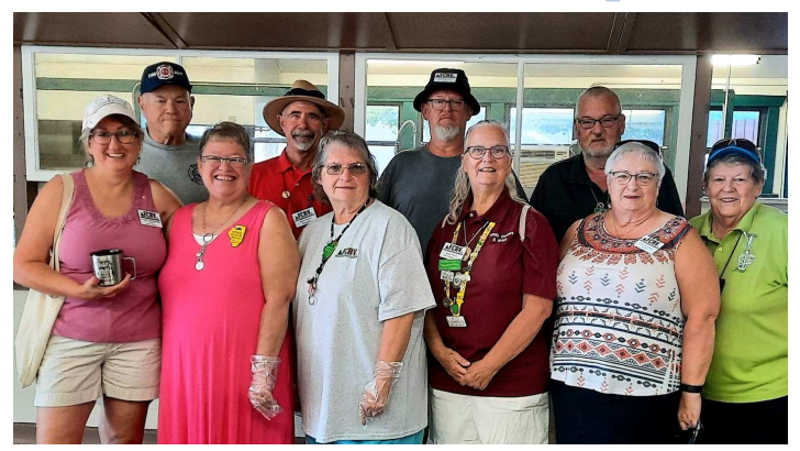
The Quackers Chapter served at the Trustees' Hospitality.