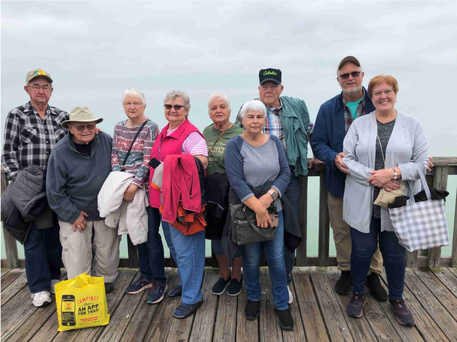
Black Dragon Cruise Crew

Items happening at your RV park during the Winter.