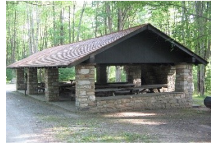
Group Sites & Shelter