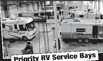
Priority RV Service Bays

Go Online To burlingtonrv.com To See Our Schedule Of FREE MONTHLY EDUCATIONAL SEMINARS!