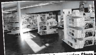
Priority RV Parts & Accessories Store