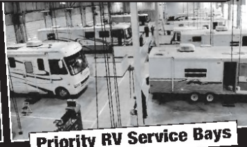
Priority RV Service Bays

Go Online To burlingtonrv.com To See Our Schedule Of FREE MONTHLY EDUCATIONAL SEMINARS!