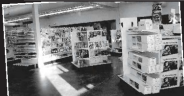
Priority RV Parts & Accessories Store