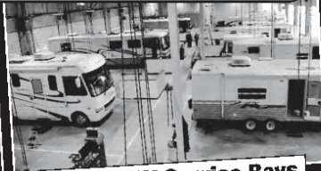
Priority RV Service Bays

Go Online To burlingtonrv.com To See Our Schedule Of FREE MONTHLY EDUCATIONAL SEMINARS!