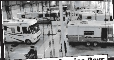
Priority RV Service Bays

Go Online To burlingtonrv.com To See Our Schedule Of FREE MONTHLY EDUCATIONAL SEMINARS!