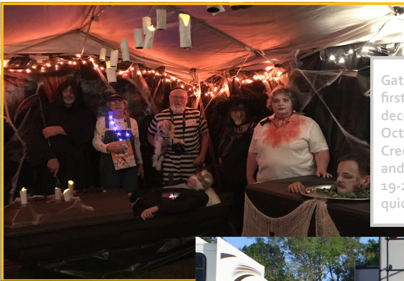
Gateway Campers won first prize at the site decorating contest in October 2017 at Big Creek RV park. Come and join us on October 19-21. Sites are going quickly so call Big Creek