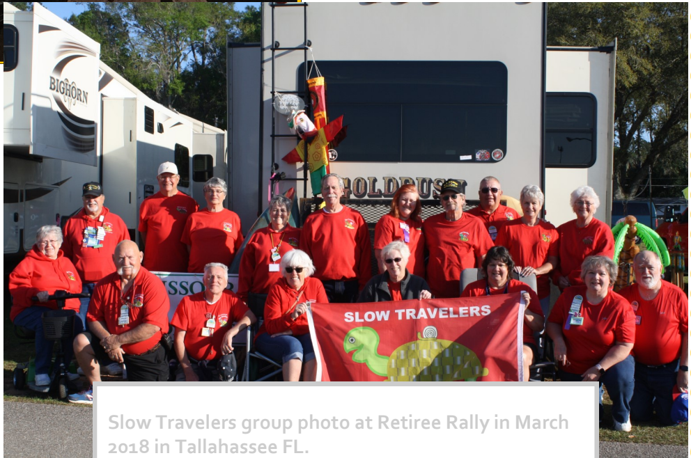
Slow Travelers group photo at Retiree Rally in March 2018 in Tallahassee FL.